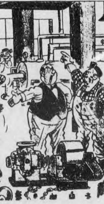
Was Never Like This . . .