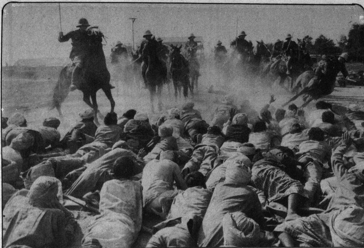
A TEGWAR demonstration at Lister Field from last summer's Universiade. The British team attacks with polo mallets and exceptionally bad breath while the Indian team tries the usually futile tactic of passive resistance.