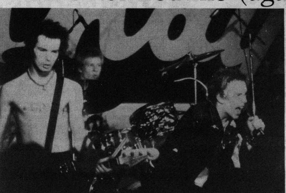
Sex Pistols on tour: revolutionaries or traditionalists?

And the punker's hostile, anti-social songs are consciously or unconsciously, almost a carbon copy of songs like those the early Rolling Stones sang: "Brought Up All Wrong," "Stupid Girl," "Play With Fire," etc. (and for my money, the Stone's "Get off My Cloud" is a better screw-the world song than the Sex Pistol's "Anarchy in the USA").