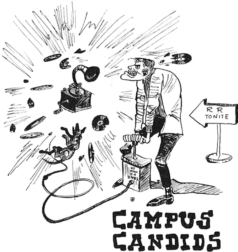
THIS IS A FRIENDLY RADSOCER. HE HOPES YOU WILL COME OUT TO THE BIG BANG AT RADIO RENDEZVOUS THIS EVENING.

LUTHERAN STUDENTS' MOVEMENT: Annual Meeting Friday, March 1, 8 p.m. West Lounge.