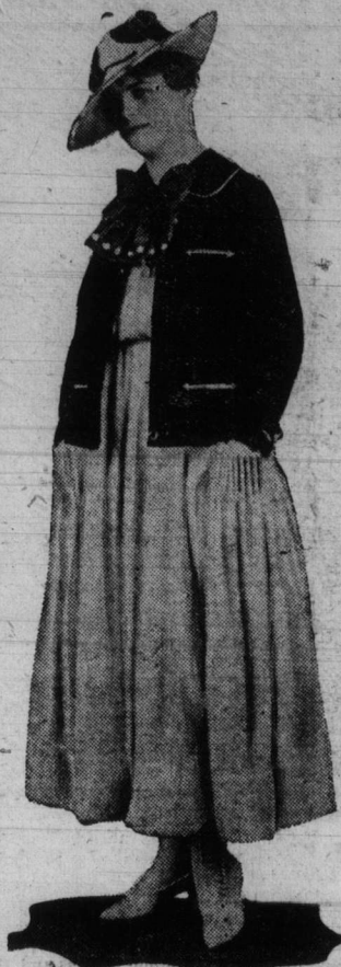
A SAUCY MODEL.

Quaintness itself is this fetching garb, a black velvet jacket over a white satin skirt. The bobbed coat, round collar and huge tie are characteristic.