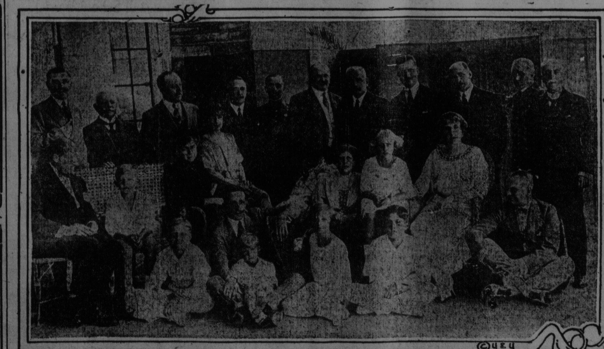
THE ENTIRE SPANISH ROYAL FAMILY

LATEST PHOTOGRAPH OF KING ALFONSO, HIS QUEEN, CHILDREN AND KIN