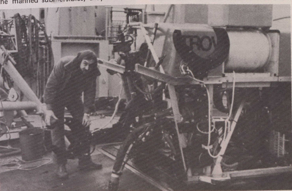
This TROV's arms are equipped with a special grasping mechanism.