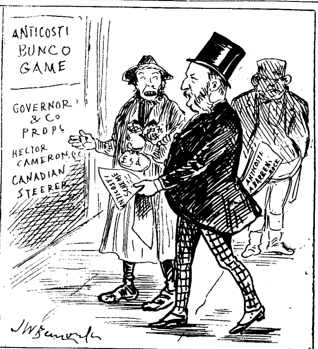
THE ANTICOSTI BUNCO-STEERER.