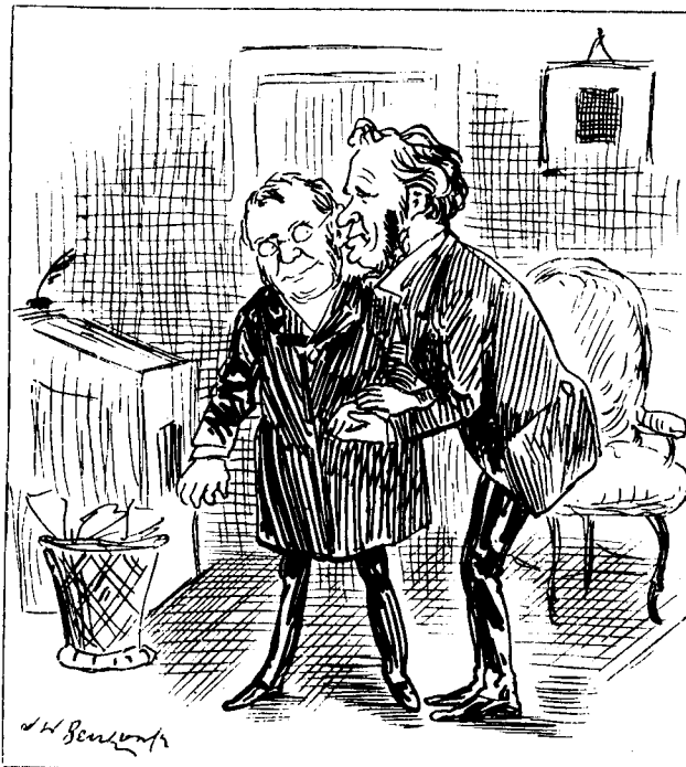
A POINTER FOR MOWAT.

Pardee (in a stage whisper).—I'll tell you what we'll do —BRING ON THE LOCAL ELECTION SIMULTANEOUSLY WITH THE DOMINION ELECTION. THIS WILL STUMP JOHN A.