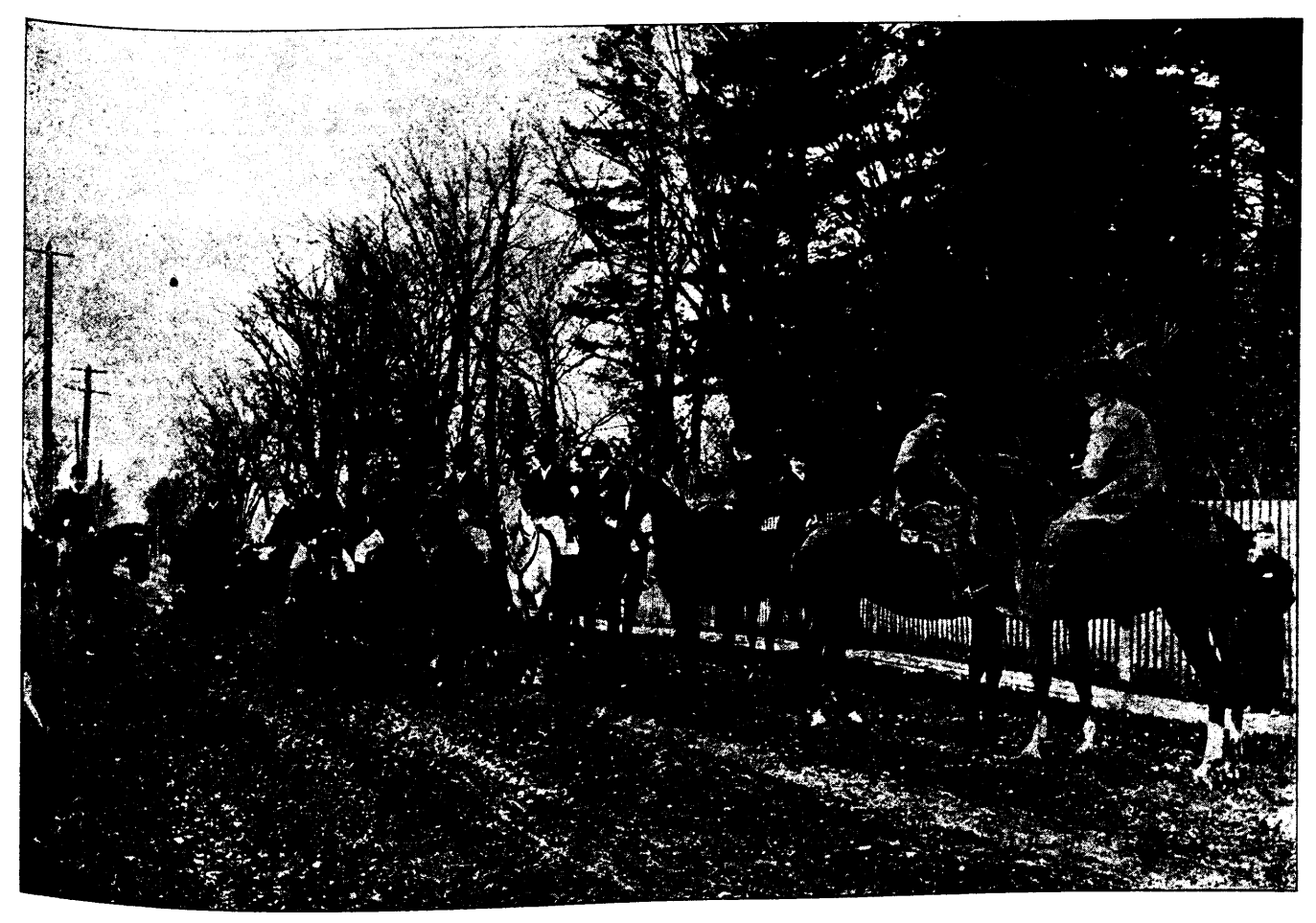
ON THE WAY TO THE MEET. THE MONTREAL HUNT CLUB.