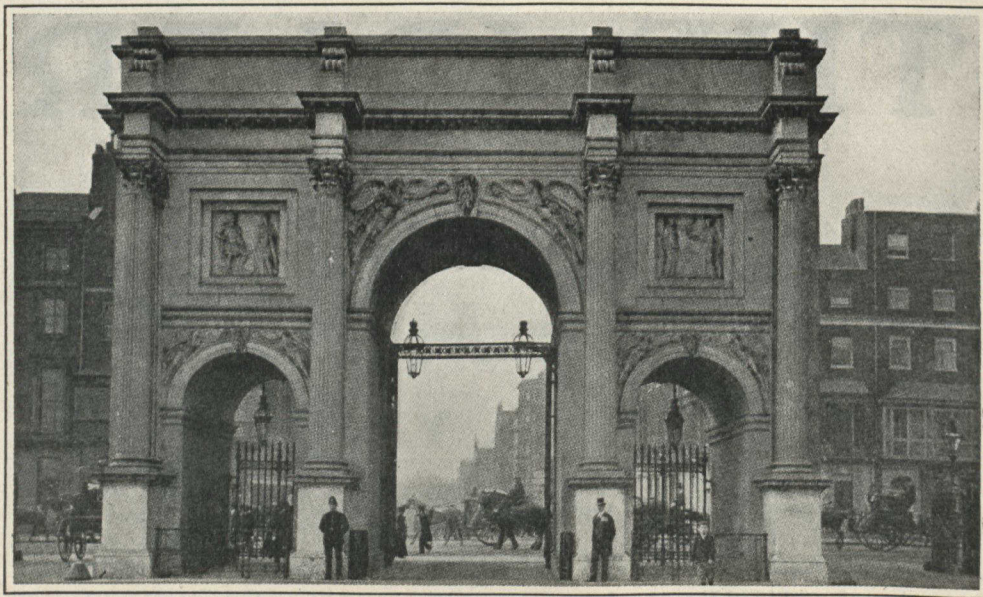
One of London's best known landmarks at the north-west entrance to Hyde Park, formerly stood in front of Buckingham Palace. Is of Carrara marble. Cost $40,000.