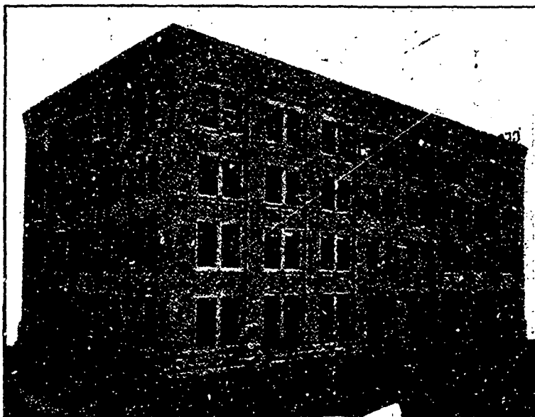
New Warehouse of Geo. D. Wood & Co., Winnipeg

This handsome structure is certainly a credit to the city, and speaks eloquently for what has already been attained in the wholesale trade here, as well as for the future of this western metropolis. The building would do credit to a much older and larger place than Winnipeg. Indeed, commercial men from the east have stated that the warehouse is not surpassed by any wholesale hardware warehouse in any of the trade centres of Eastern Canada.