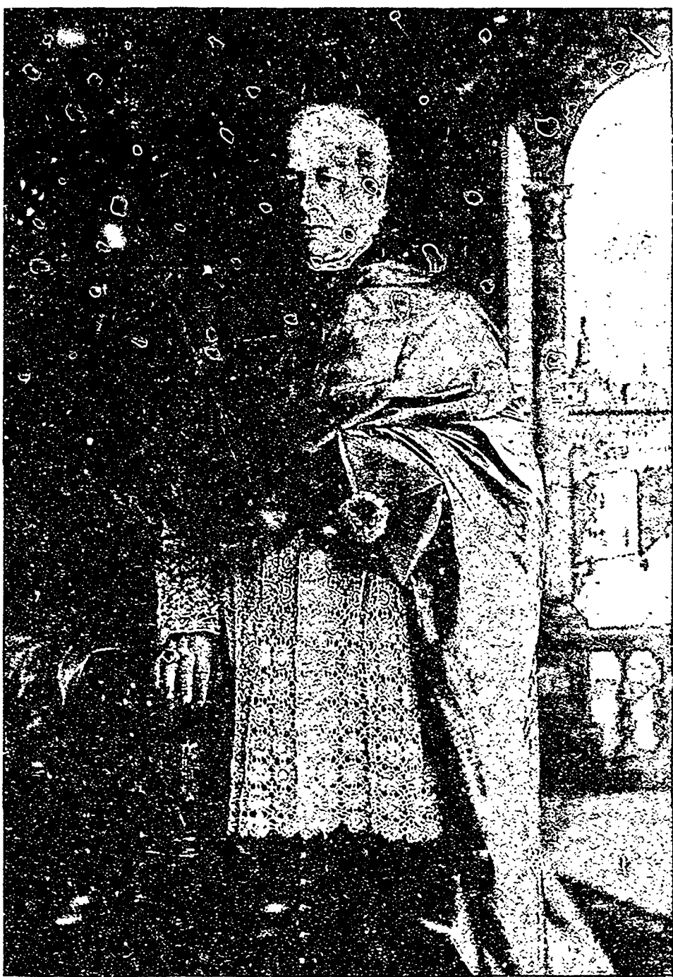
HIS EMINENCE, CARDINAL TASCHEREAU.