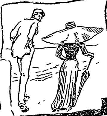
Smith thinks the sunshade hat is all very well