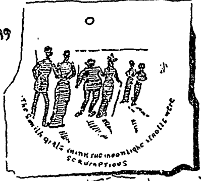
The Smiths of the beach think the moonlight is really very scrumptious