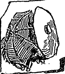
in its way. — but it's a thundering nuisance sometimes