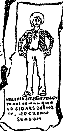
Whether it's a penny or a dime, they give up cigars during the ice cream season