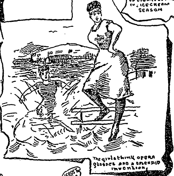
The girls think opera glasses are a splendid invention