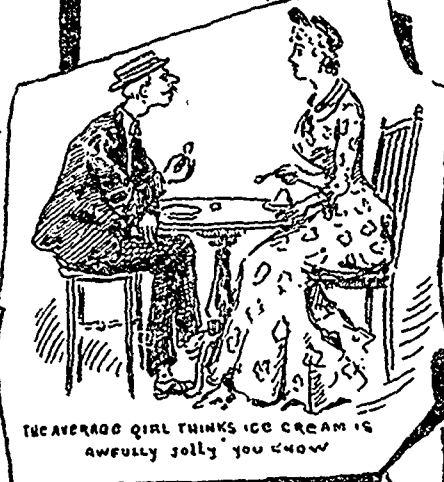
The average girl thinks ice cream is awfully jolly, you know