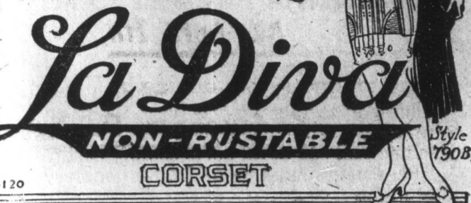
La Diva NON-RUSTABLE CORSET

Sold and recommended by leading corsetiers.