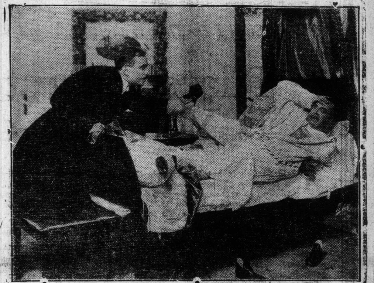
Scene from Avery Hopwood's Farce that madetheweatherfamous, "Fair and Warmer," at the Grand Opera House Thursday night, Feb. 5th.

Ottawa, Jan. 31.—Ex-employees of the Postoffice Department who went on sympathetic strike at Winnipeg, have, it is officially announced, been restored to full citizenship so far as their further employment by the Government is concerned.