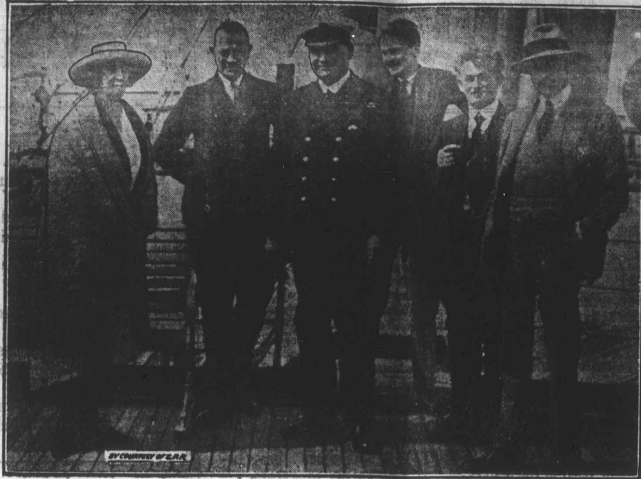
NEW GOVERNOR-GENERAL'S ARRIVAL IN CANADA.

Regular Sailings Between Halifax, St. John's and Liverpool, Eng. Halifax—London, Eng. Every facility for Export of Apples Passenger Service Halifax St. John's Liverpool Apply to Furness Withy & Co., Ltd. Halifax, N. S. St. John, N. B. Sydney, N. S. Montreal