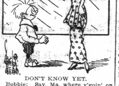
DON'T KNOW YET. Bobbie: Say, Ma, where y'goin' on vacation this summer? Ma: I got to wait till I find out where your father don't want to go.