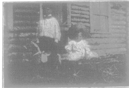
THE PRAIRIE EXPRESS