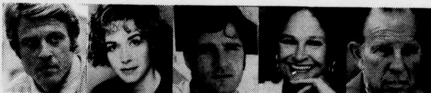
Robert Redford Melanie Mayron Elias Koteas Colleen Dewhurst Hume Cronyn

AMERICAN ACADEMY OF DRAMATIC ARTS 120 Madison Avenue, New York, NY 10016 (212) 686-9244 2550 Paloma Street, Pasadena, CA 91107 (818) 798-0777