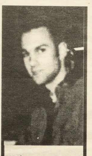
"About a 6. My legs, I guess, because they are marble."