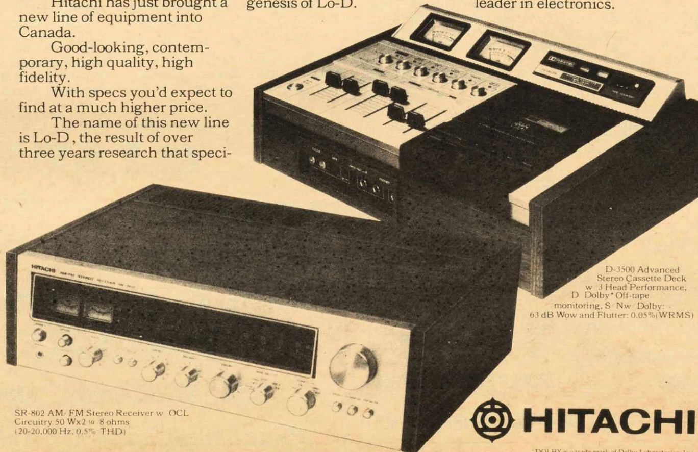
SR-802 AM/FM Stereo Receiver w/ OCL Circuitry 50 Wx2 @ 8 ohms (20-20,000 Hz, 0.5% THD)

The kind of achievement that has made Hitachi a world leader in electronics.