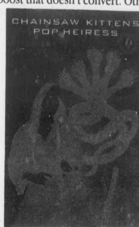
table influences — this isn't shoegazer material, but you can tell that the band listened to My Bloody Valentine a bit: there's a muffled quality to the odd guitar line that betrays this pleasant tendency.

Overall, I don't think this album has longterm appeal, and I don't think the band does either unless they change. The Potential is unmistakably there — from the hook of 'Sore on the Floor' to the variety of tracks like 'I Ride Free' and 'We're Like.' In between, however, there's too much sizzle and not enough sub-