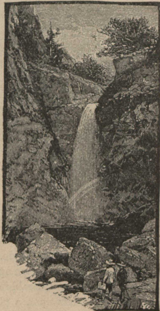
RAINBOW FALLS, COLORADO.

HENRY WARD BEECHER once said that while the new birth was necessary to a true Christian life, it was very important that one be born well the first time. Colorado Springs was born well. It was organized on the colony plan, and the first stake was driven in July, 1871. Intelligent and far-seeing men were leaders of the enterprise; and in no way was their sa-