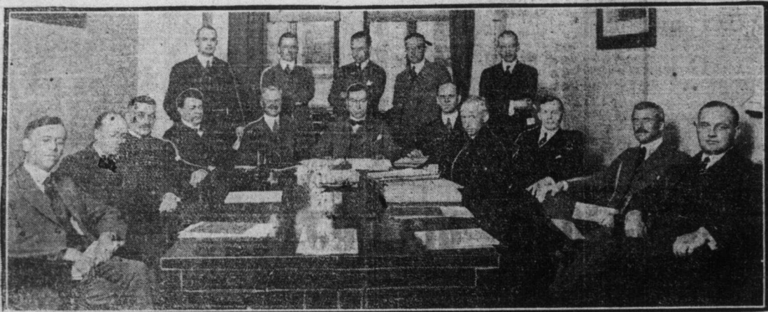
ONTARIO VICTORY LOAN ORGANIZATION COMMITTEE — Organization minus into a nation of investors. The Ontario Organization Committee Chairman, has undertaken the colossal task of organizing every County person will go uncanvassed. The members of the Committee are shown

has been responsible largely for the conversion of the people of the District in this Province, total sixty units, in such a way that in the above illustration.