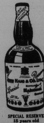
SPECIAL RESERVE 15 years old