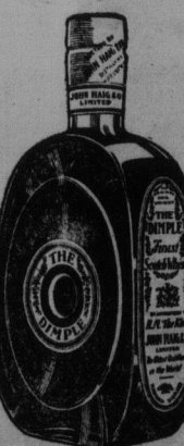
"DIMPLE" SCOTCH 20 years old