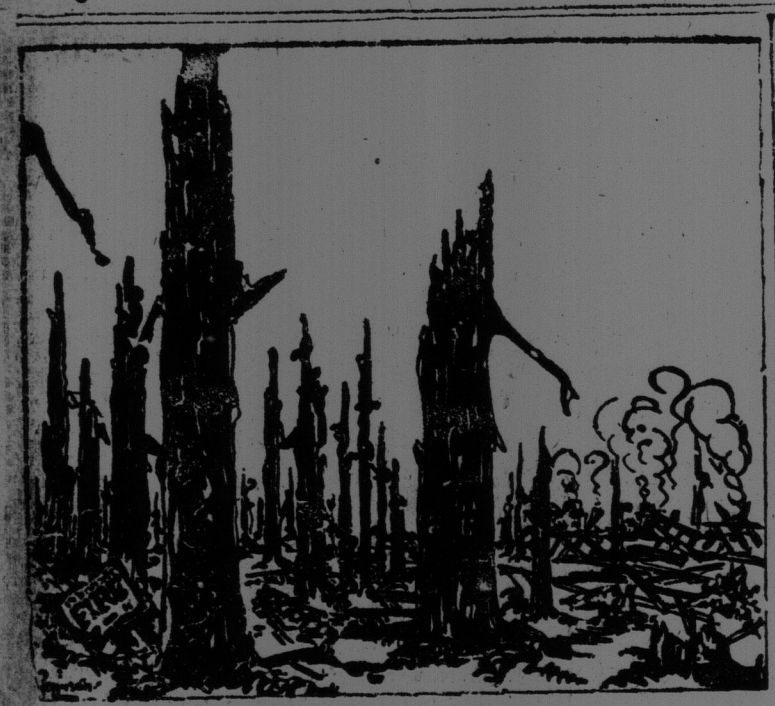
"A good servant, but a bad master." -British and Colonial Press.