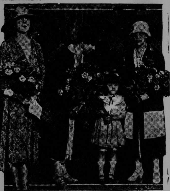
Here are Washington's three most noted women, photographed together at the spring flower show there. At the left is Alice Roosevelt Longworth; in the center is Mrs. Calvin Coolidge, and at the right is Mrs. Charles G. Dawes. Note the earrings and the turban hat which Mrs. Coolidge is wearing. These are new styles for her.