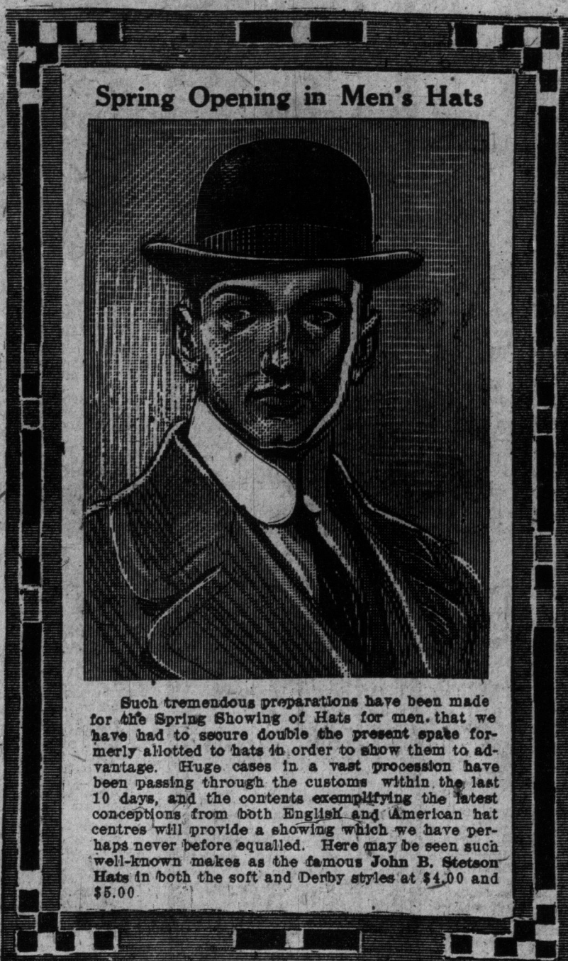
Spring Opening in Men's Hats