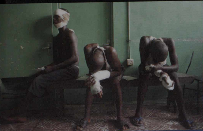
In Freetown, Sierra Leone, on May 26, 1998, young men whose ears, hands or fingers were chopped off by rebels the previous day wait outside a hospital operating room.