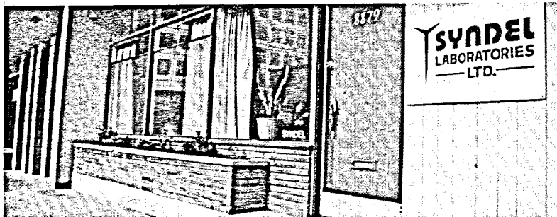
Head office building of Syndel Laboratories Ltd. on Selkirk Street in Vancouver.