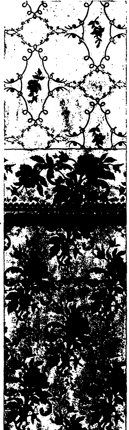
Combination No. 1203.