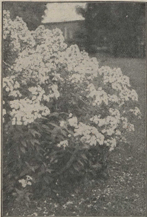
Border of Perennial Phlox