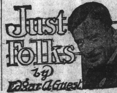
TO THE BOY.

Soper & Moore Wholesale Importers and Jobbers.