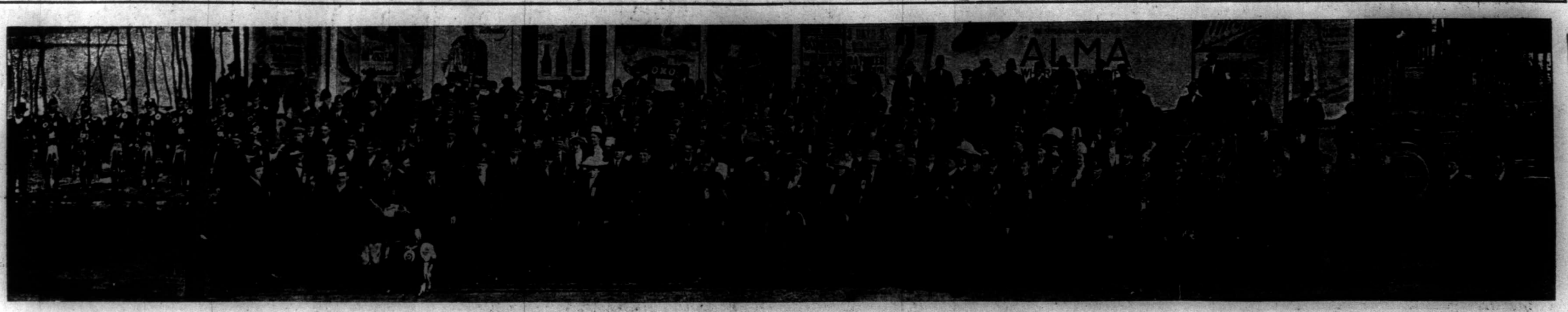
Provincial Shriners Attending the Grand Ceremonial in Edmonton Last Week