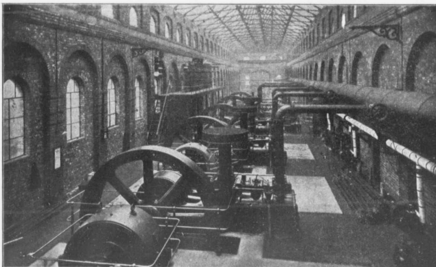
200 H.P. "Premier" Gas Engines and D. C. Generators SOLE CANADIAN LICENSEES