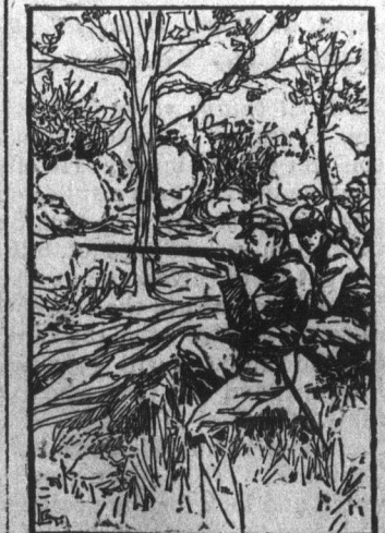
"Don't you fire at him!"

"Take my pistol and give me yours. Mine is in perfect order, and, as I