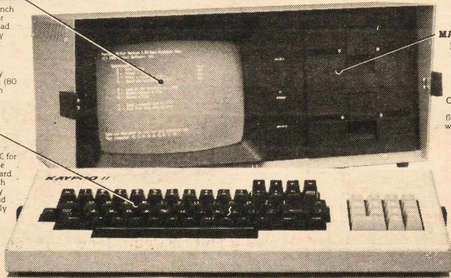
The new Kaypro II portable business computer.

Osborne 1: Standard typewriter detachable keyboard with cursor control keys and 12-key numeric