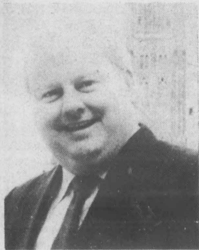
Ottawa from the inside