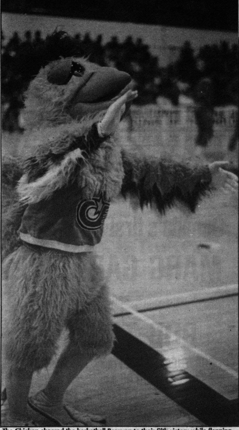
The Chicken cheered the basketball Bears on to their fifth victory while flapping his way to an $8000 cheque. The gory details on page 13.