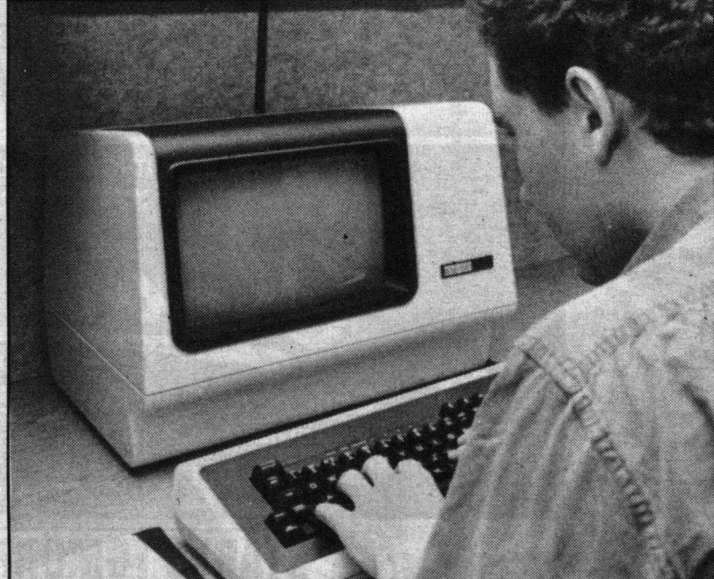
Bright-eyed students may soon pay for use of bright, new, high-tech computers.

There will be five new rooms for microcomputers: three in CAB, one in Chemical Engineering and one in the Business Building.