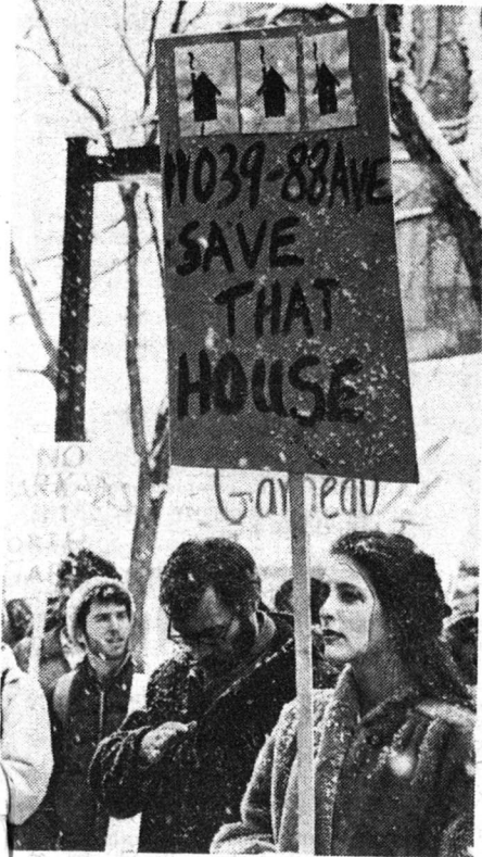
...and here are the masses who can't change what's going to happen in North Garneau.

North Garneau was proposed in mid March. The plan designates half the area as permanent housing, and the rest for future expansion.