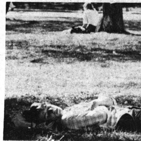
May isn't far off, and neither is Spring Session.

Have a nice summer. Your fall could be pretty dismal.