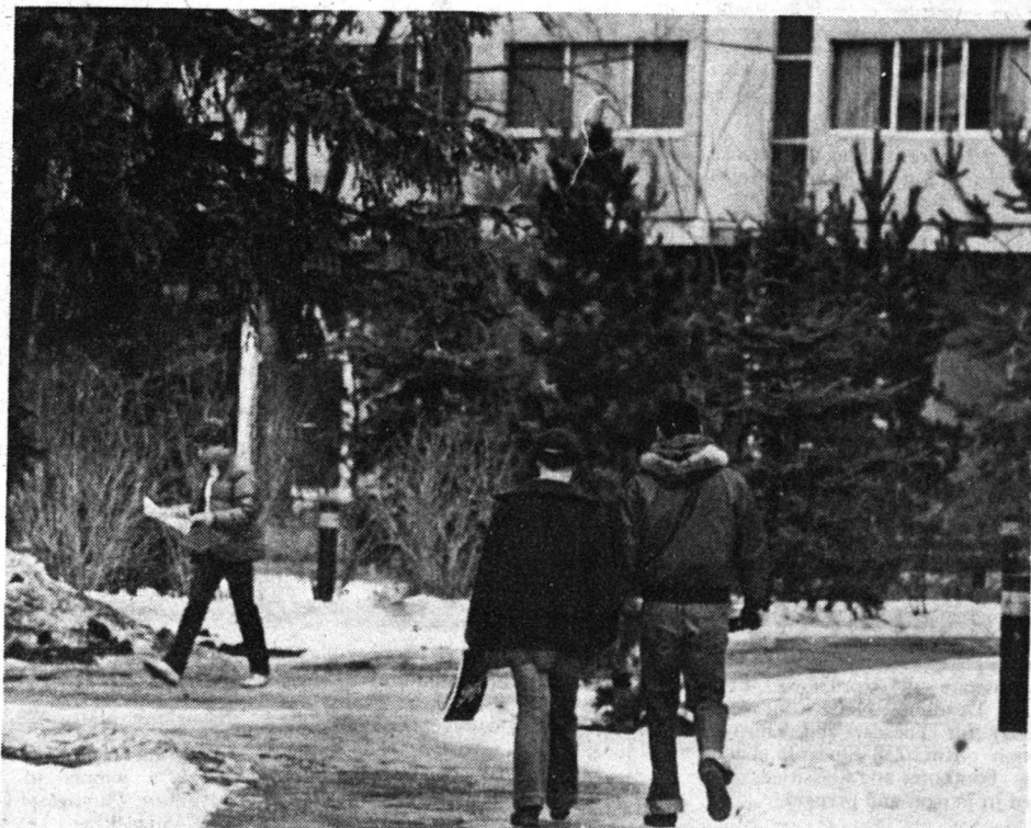
But remember, there's always next year, with eight months of winter.