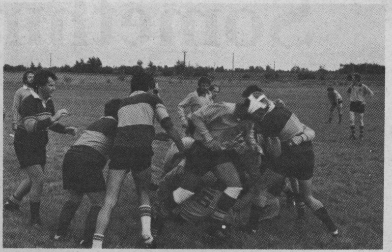
Leperchaun's magic no use against Bears.

Quite the contrary, from all appearances, soccer hysteria doesn't seem far off in this neck of the woods. Lately, it seems that everybody and his dog is out kicking a soccer ball around. Over the past summer, spurred on by the acquisition of a new professional soccer team for Edmonton and in general more coverage of the sport both on television and in the press, the game has been increasing almost daily in popularity.