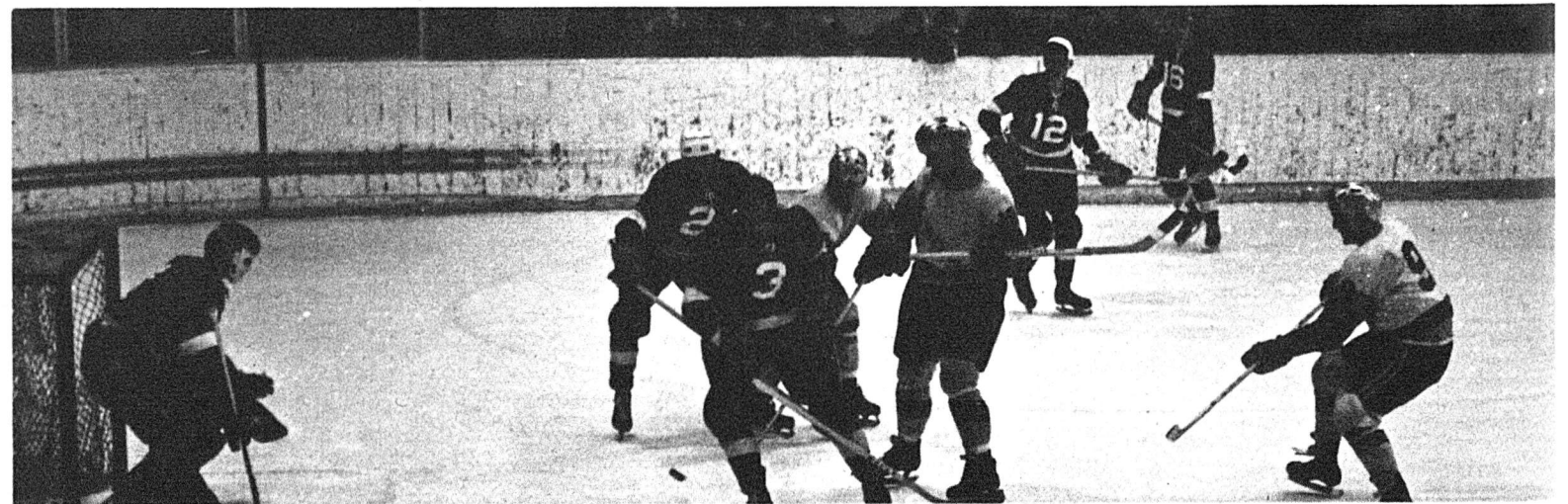
BEARS HOVER AROUND WESMEN'S GOAL MOUTH