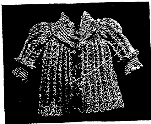
FIGURE No. 3.

Finish sack with tinted, twisted embroidery silk in all the scollops, by making 3-chs. and s. c.; and then between each scollop carry the silk up with 5-chs. for 3 rows and catch it back again. Finish the lower part of yoke with scollops edged with silk. Unless double worsted is mentioned, use single.