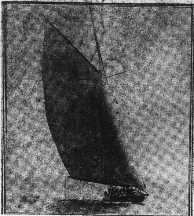
The Shamrock IV, Sir Thomas Lipton's challenger for the American Cup, on her first trials in American waters off City Island, New York, to-day. The racing sloop showed great speed in the brisk wind and her handlers and crew were greatly pleased with her performance.