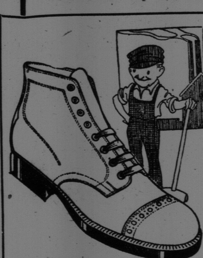
These work shoes will stand a lot of pounding

Boys' Service Boots Yours for Comfort! COMFORT is what you want first in any shoe—especially a Work Shoe. You'll get that here.