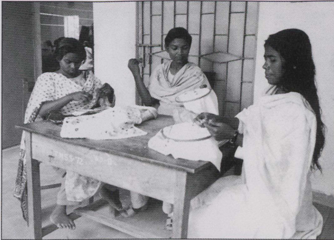
Skill training provided to enable them to initiate micro enterprises by utilising their own resources