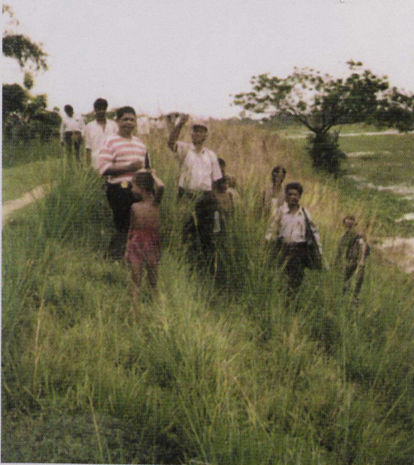
'The Miracle Grass' Vivifer grass planted on the embankment to protect from erosion by rain and flood