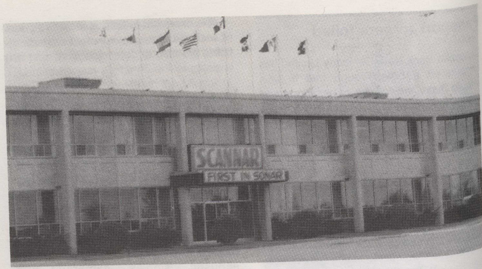
Scannar Industries' plant in Cornwall, Ontario.

The Cornwall firm is now working on an even more advanced model, the Multi-MAQ, with longer range and higher resolution. It is aimed at the military, scientific and petroleum markets. If a machine can be built that can