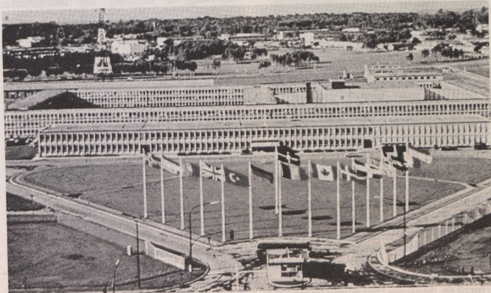
NATO today. Supreme Headquarters Allied Powers Europe (SHAPE) near Mons, Belgium.

Membership in NATO has been a major part of Canada's foreign policy for 30 years. NATO is both a collective/defence organization and a forum for political consultation. Successive federal govern-