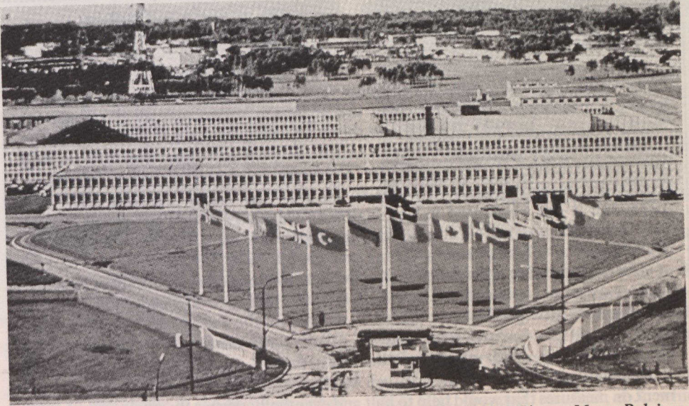
NATO today. Supreme Headquarters Allied Powers Europe (SHAPE) near Mons, Belgium.

Membership in NATO has been a major part of Canada's foreign policy for 30 years. NATO is both a collective/defence organization and a forum for political consultation. Successive federal govern-