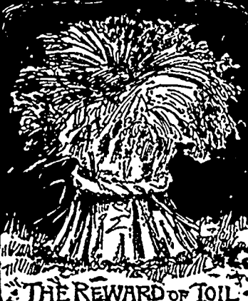
THE REWARD OF TOIL

SEMI-MONTHLY MAGAZINE * DEVOTED TO THE * FARM AND GARDEN · STOCK · POULTRY · * * · ORCHARD · APIARY · * * GRANGE · DAIRY · HOME-CIRCLE ·